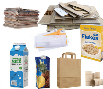
MIXED PAPER, UNWAXED CARDBOARD, PAPERBOARD, PAPER CARTONS, ASEPTIC PACKAGING