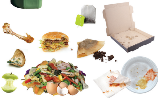
FOOD SCRAPS & FOOD SOILED PAPER

Green container size available: 64-gallon