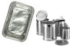
METAL CANS & CONTAINERS