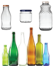
GLASS BOTTLES, AND JARS

Blue container size available: 64-gallon