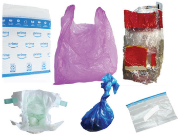
PLASTIC BAGS, PET WASTE & DIAPERS

Gray container sizes available: 32, 64, or 96-gallon