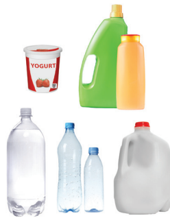
PLASTIC BOTTLES, TUBS AND JUGS