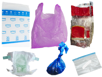
PLASTIC BAGS, PET WASTE & DIAPERS

Gray container sizes available: 32, 64, or 96-gallon