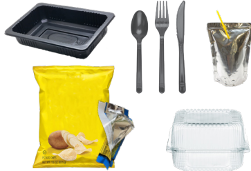
WRAPPERS & NON-RECYCLABLE PLASTIC