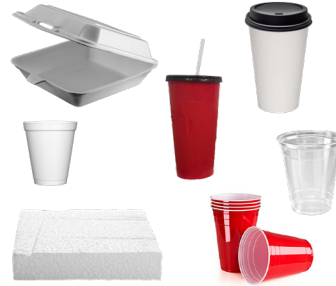
STYROFOAM™ & CUPS