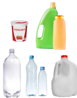
PLASTIC BOTTLES, TUBS AND JUGS