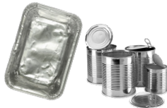
METAL CANS & CONTAINERS