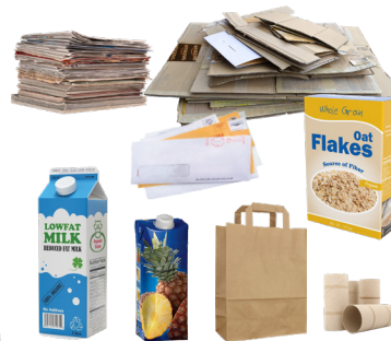
MIXED PAPER, UNWAXED CARDBOARD, PAPER- BOARD, PAPER CARTONS, ASEPTIC PACKAGING