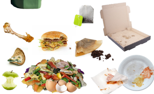
FOOD SCRAPS & FOOD SOILED PAPER

Green container size available: 64-gallon