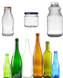
GLASS BOTTLES, AND JARS

Blue container size available: 64-gallon