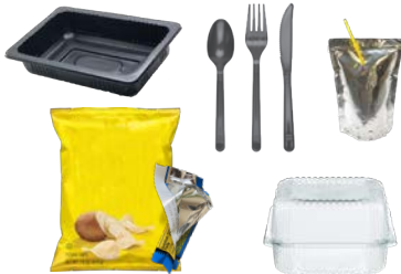
WRAPPERS & NON-RECYCLABLE PLASTIC