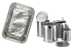
METAL CANS & CONTAINERS