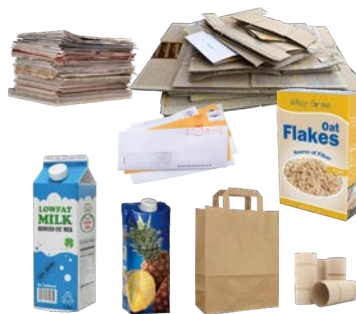
MIXED PAPER, UNWAXED CARDBOARD, PAPER- BOARD, PAPER CARTONS, ASEPTIC PACKAGING