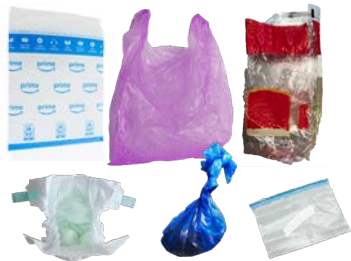
PLASTIC BAGS, PET WASTE & DIAPERS

Gray container sizes available: 32, 64, or 96-gallon