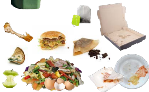
FOOD SCRAPS & FOOD SOILED PAPER

Green container size available: 64-gallon