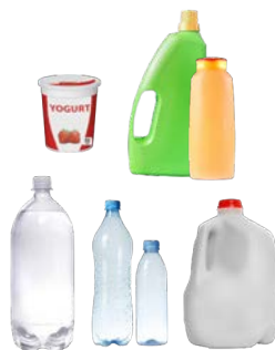
PLASTIC BOTTLES, TUBS AND JUGS