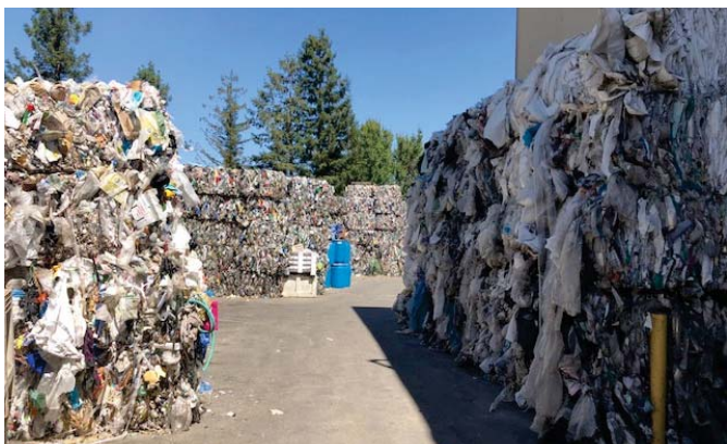
Bales of plastic bags stored at our materials recovery facility in St. Helena.

We are no longer able to accept plastic bags in our recycling program, in part due to the lack of markets for these low-grade plastics. Plastic bags should be thrown away in your brown trash cart. This includes similar items like produce bags, newspaper bags and sandwich bags. (Look up zero waste shopping online for ideas on how to reduce plastic use). Use clear bags or no bags to collect your recyclables. Do not use black or green garbage bags to collect your recyclables. Please take a moment to read the list to the right of what is recyclable in your blue cart. We will be placing a sticker showing recyclable items on all recycling carts in our service area.